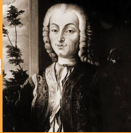
In Baroque Harpsichord